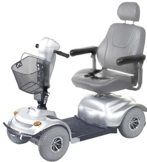
Model GA 541