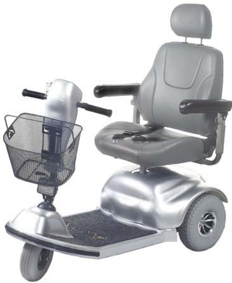
Model GA 531