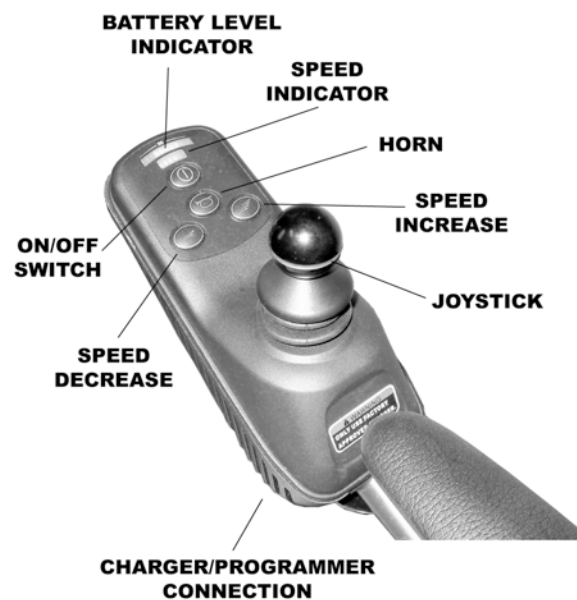
Figure 2 — Controller

Indicates selected maximum speed of the power chair, as selected by the Speed Increase/Decrease controls (see following). Faster speeds are indicated by the number of lamps lit (total, 5).