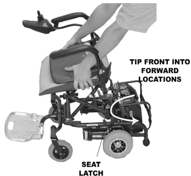
Figure 3 — Installing the Seat