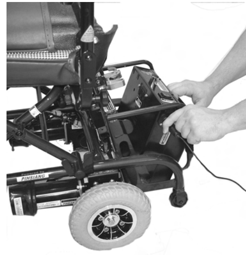
Figure 5 — Battery Pack Charging Connection