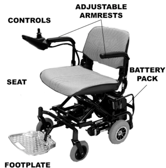
Figure 1 — Components

Welcome to the world of freedom and independence. In this section, we will acquaint you with the many features of your UltraLite Fold & Go PowerChair and how they work. Upon receipt of your PowerChair, inspect for any damage. Major components of your Power Chair are shown in Figure 1. You should familiarize yourself with these components before using your Power Chair.