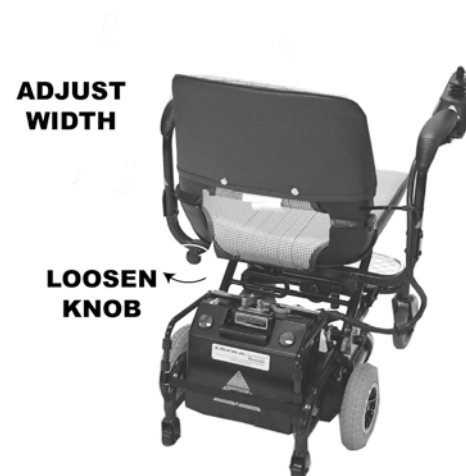
Figure 6 — Armrest Adjustments

Additionally, the armrests can be folded down and out of the way for easier movement in and out of the seat. Lift the armrest up at the rear to disengage and fold downward. Moving armrest up and lifting at rear until it engages into bracket returns armrest to riding position.