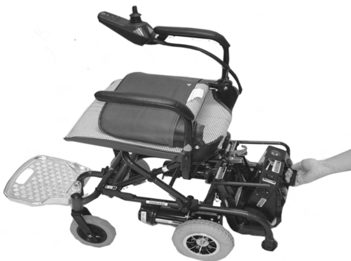
Figure 4 — Installing the Battery Pack

Battery may not be fully charged upon installation. Refer to the following to recharge the Battery Pack of your Fold & Go.