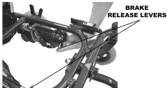
Figure 7 — Drivetrain Brake Release Levers