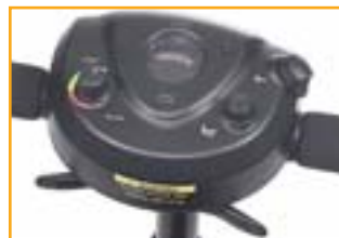
Easy to drive!