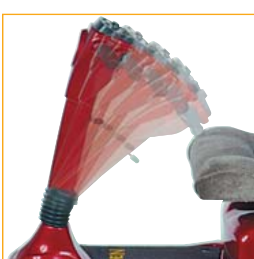
Patented infinite adjustable tiller