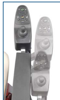
Retractable control arm standard