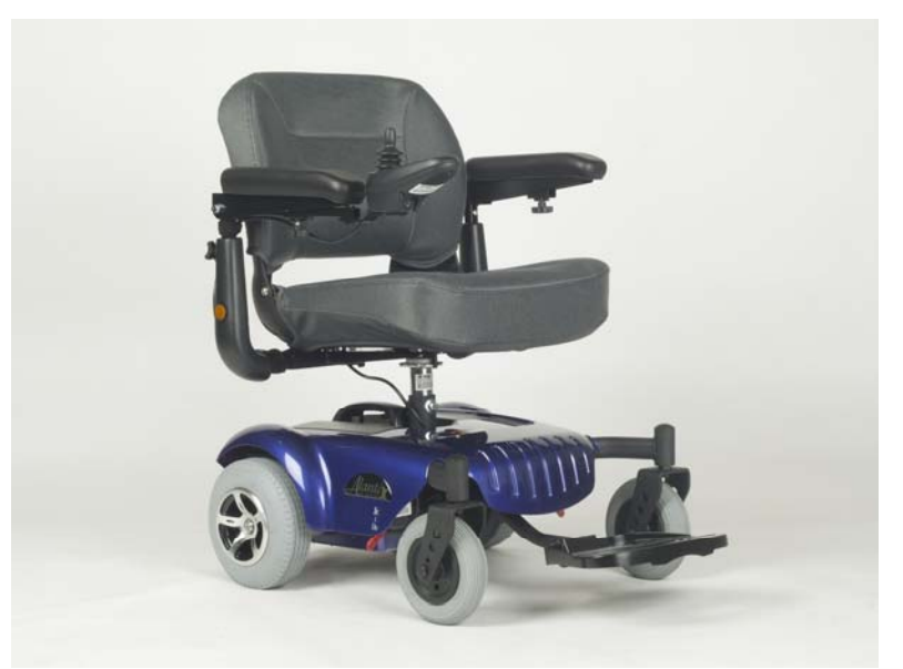
Alante Jr. GP200 – (Arctic Blue Body Color)

Please read and thoroughly understand "Safety Rules" and "Driving On An Incline" sections of this manual.