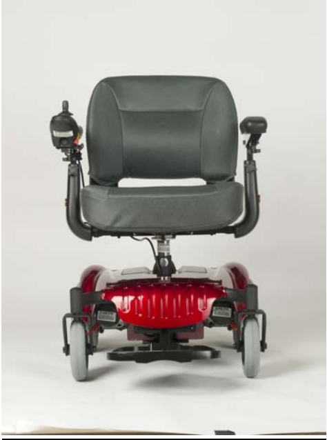
Alante Jr. GP200 (Candy Apple Red Body Color)