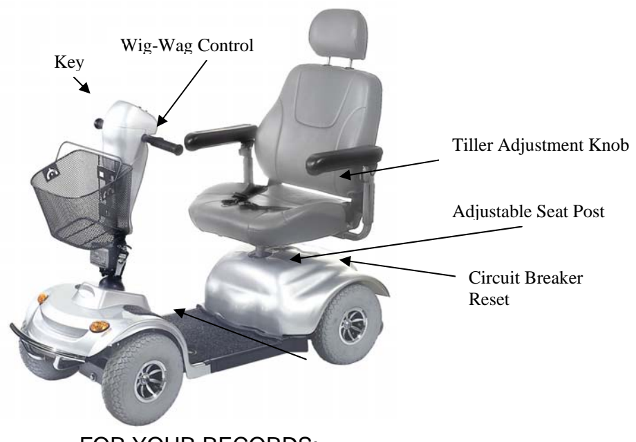
FOR YOUR RECORDS:

Please fill in your Avenger™ information below. This information will be useful in the event that you ever need to contact Golden Technologies concerning your scooter.