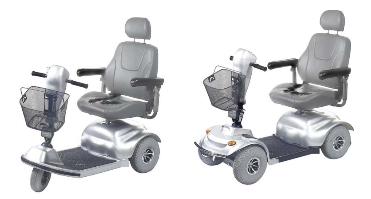
Model GA 531